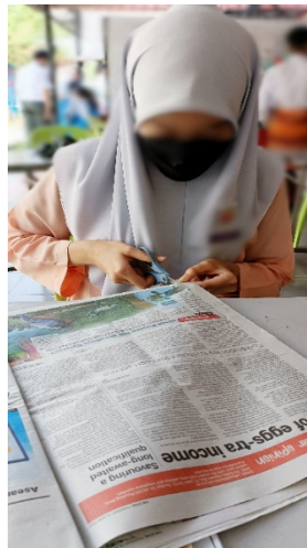
Picture 2 Presentation