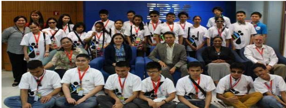
Computer-Eyes participants with the IBM Philippines administrators

Keeping up with the fast changing computer technology is very challenging especially persons with visual fo The accessibility to information and communication technology (ICT) is important in the education of persons with disability as it enables them to have access to their academic, social, and eventually employment opportunities that have traditionally been limited for them. However, while there is awareness that access to education through ICT should be equitable and accessible for students with visual impairment, they the least are priority.