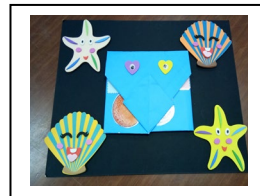
Figure 3 : Letter book