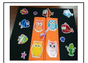
Figure 6 : Gate fold/ Z fold