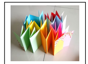
Figure 2 : T book