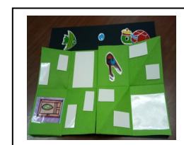
Figure 7 : Flower fold