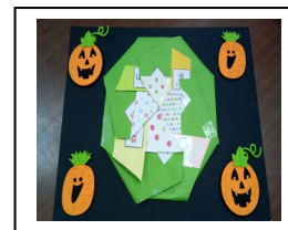
Figure 5 : Eight-leaves