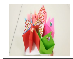
Figure 1 : Castle house

There are eight Origami Magic using as educational tools to improve reading and writing performances in Bahasa Melayu. A piece of A4 paper or manila card with some word cards and picture cards are used to create new games or creative activities for remedial pupils. Different shapes and variety of colors allows students to develop psycho motor skills and they helps hand, eye muscles and hand-eye coordination to develop. 'Use a piece of paper, make a simple book' is described as new innovation for remedial pupils. In addition, open a possible world will make a big difference for children better life. Variety types of Origami Magic helps to improve the reading and writing achievement in Bahasa Melayu.