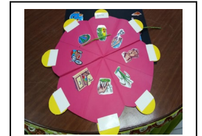
Figure 4 : Ice Cream book