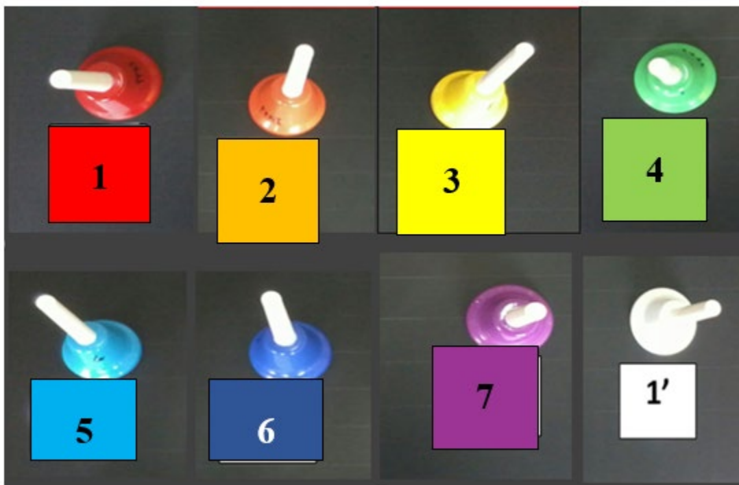
Figure 6 Angklung has been labelled with colour and number notation