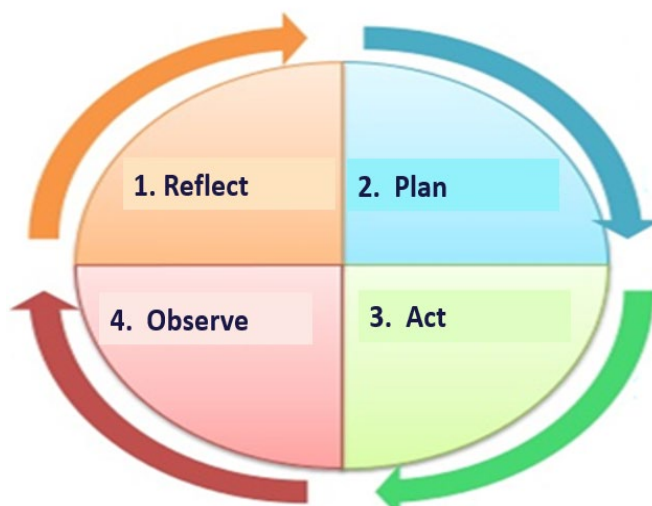
Figure 3 Kemmis & McTaggart Model (1988)

Researchers practiced the constructed model from Kemmis & McTaggart (1988) in order to conduct this study.