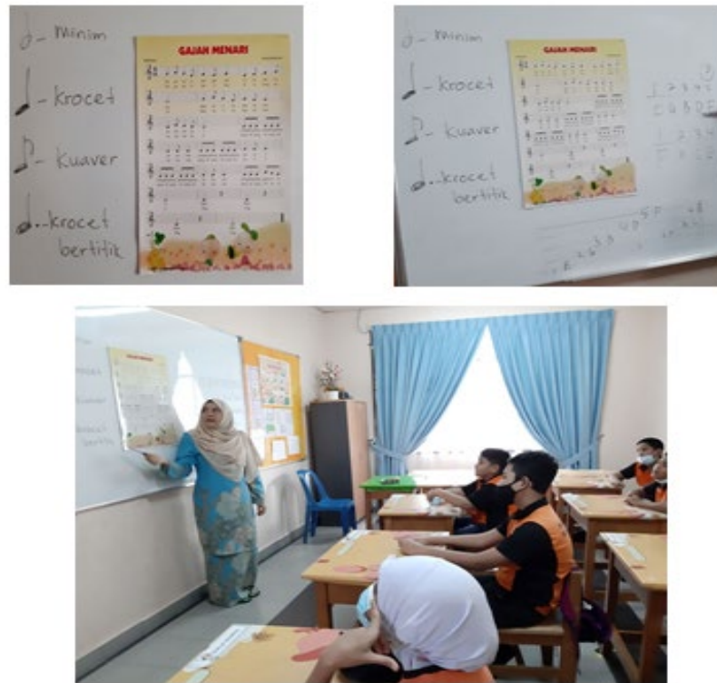
Figure 4 PPKI Students unable to recognize the music notations