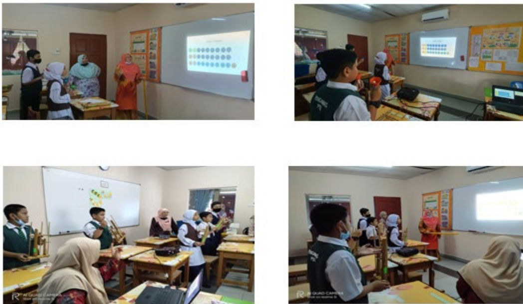
Figure 7 Students can read and understand the notation of songs that have been innovated with confident, happy and excited.

The researcher recorded the performance of PPKI students in video playing musical instruments such as Angklung and bell well based on the musical notation that has been innovated to colour code and number. In addition, the coordination between the mind, eyes and hands of students can also be improved and more focused when reading the musical notation.