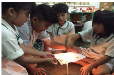
Figure 2 - Students working in group during peer tutorial session

In regard to peer tutorial sessions, the student tutors were given opportunities to select a BTYL sub theme that they would like to teach to their peers. The structure of the tutorial sessions as follows: a) teacher mentor and student tutor introduce themselves and tell the goals of the activity; b) teacher mentor explains about the experiment; c) student tutors demonstrate the experiment; d) teacher mentors divides the students in the class to work in groups; e) student tutor gives the equipment and experiment materials to each group; f) the students work with the student tutor conducting the experiment; g) the teacher mentor makes a documentation; h) teacher mentor opens the class discussion and the student tutor answers the question from the students; i) teacher facilitating the students to conclude the experiment; j) the student tutor and the students clean up the experiment equipment.