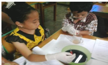
Figure 2 - Student tutors learning about composting

In regard to peer tutorial sessions, the student tutors were given opportunities to select a BTYL sub theme that they would like to teach to their peers. The structure of the tutorial sessions as follows: a) teacher mentor and student tutor introduce themselves and tell the goals of the activity; b) teacher mentor explains about the experiment; c) student tutors demonstrate the experiment; d) teacher mentors divides the students in the class to work in groups; e) student tutor gives the equipment and experiment materials to each group; f) the students work with the student tutor conducting the experiment; g) the teacher mentor makes a documentation; h) teacher mentor opens the class discussion and the student tutor answers the question from the students; i) teacher facilitating the students to conclude the experiment; j) the student tutor and the students clean up the experiment equipment.